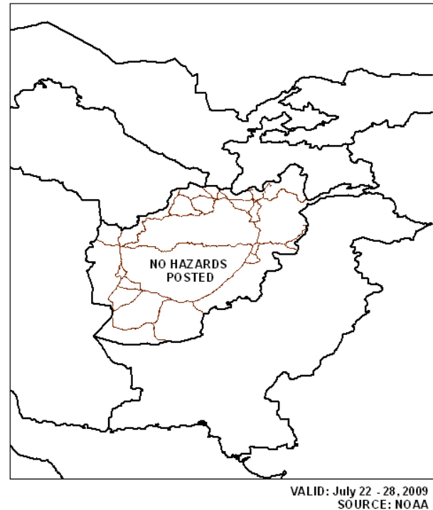
Figure 1. Weather hazards in Afghanistan