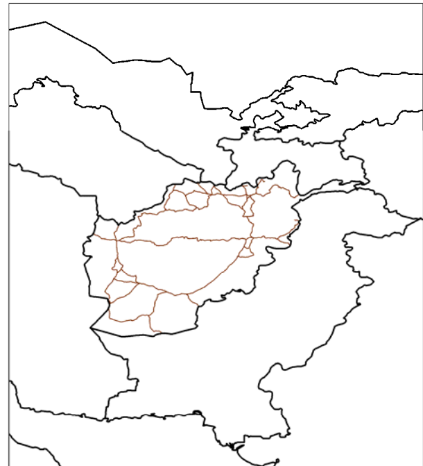
Figure 1. Weather hazards in Afghanistan

During the next week, dry weather can be expected across much of Afghanistan with precipitation limited to the northeast mountains. Temperatures should average within several degrees (°C) of normal. Extreme maximum temperatures could exceed 40 °C in southern and western Afghanistan.