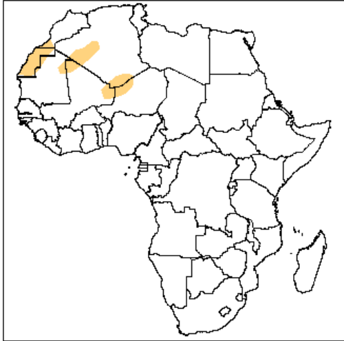
Day 1 Dust forecast Jul 30, 2015