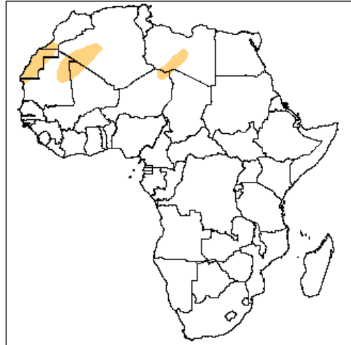
Day 2 Dust forecast Jul 31, 2015