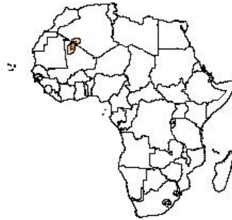
Day 2 Dust forecast July 12, 2014