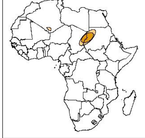
Day 2 Dust forecast 12 March, 2014