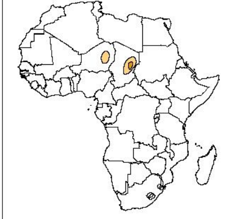
Day 1 Dust forecast 11 March, 2014