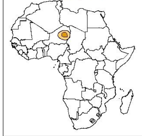
Day 2 Dust forecast 07 March, 2014