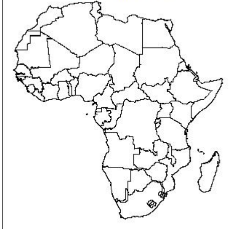
Day 1 Dust forecast 06 March, 2014