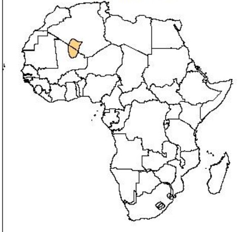
Day 1 Dust forecast 29 March, 2014