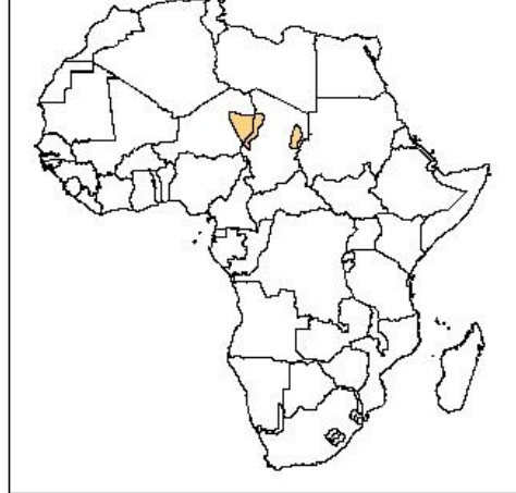
Day 2 Dust forecast 14 March, 2014