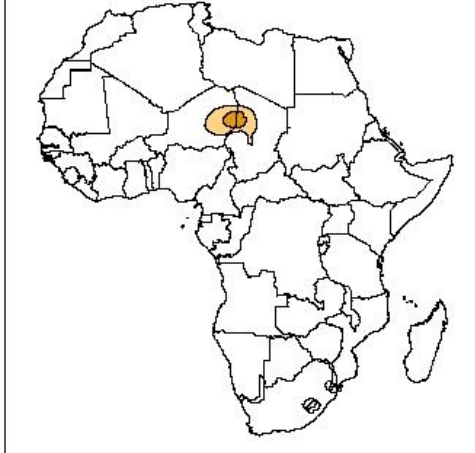
Day 1 Dust forecast 13 March, 2014