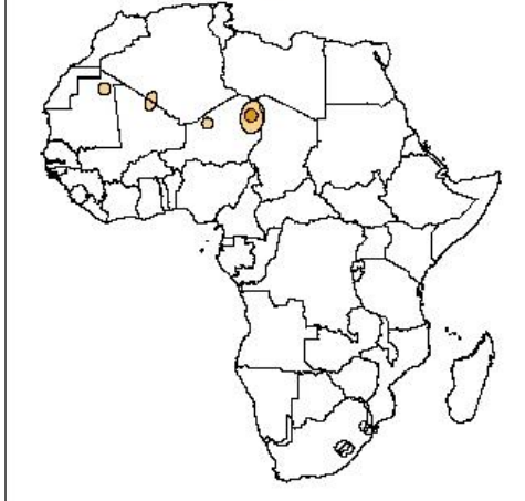
Day 1 Dust forecast 08 March, 2014