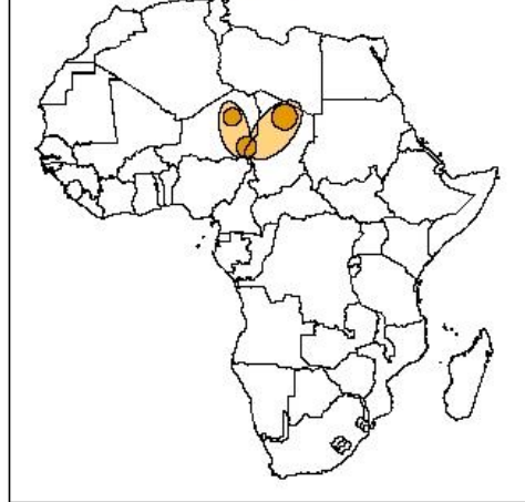
Day 2 Dust forecast 09 March, 2014